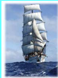
-Ella Wheeler Wilcox

One ship drives east and another drives west With the selfsame winds that blow. 'Tis the set of the sails And not the gales Which tells us the way to go. Like the winds of the sea are the ways of fate, As we voyage along through life: 'Tis the set of the soul That decides its goal, And not the calm or the strife.